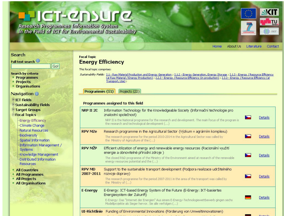
Figure 2. Example of the result list (programmes and projects) of a query or selection.

Information System. However, the information on national research programmes and projects on the Internet often is available in the national language only. Moreover, this information frequently is insufficient and/or outdated. Initial collection of information for the system may therefore be accomplished with good quality only with the support of national experts speaking the respective country's local language.