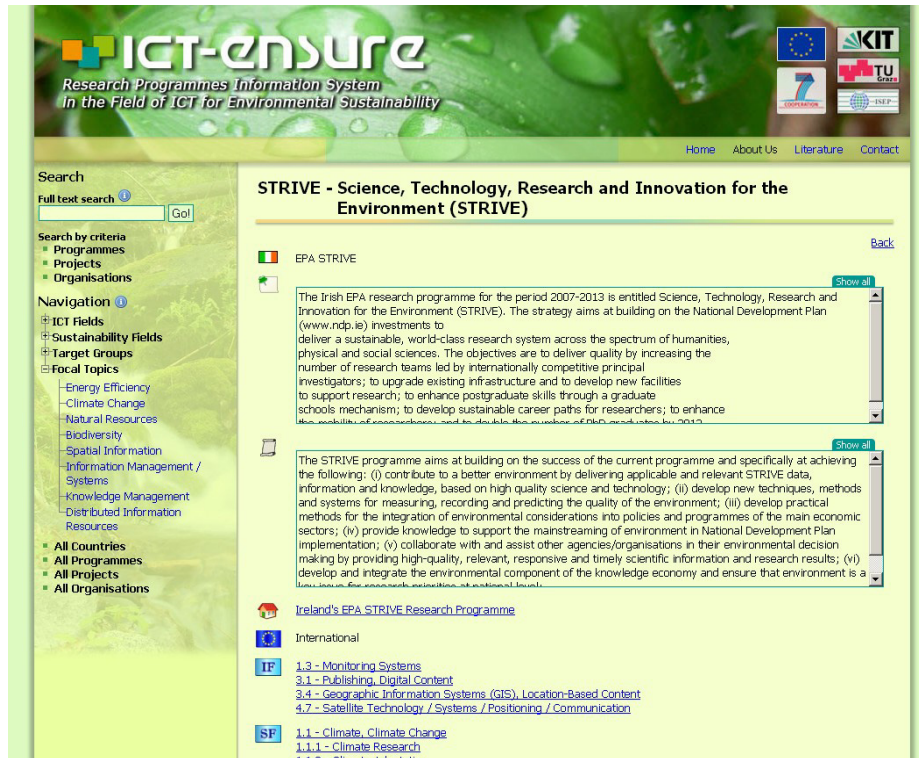
Figure 3. Example of the metadata of a research programme.

To limit the administrative expenditure for initial data collection, the national experts usually analyze a cluster of countries, such as e.g. the Scandinavian States or the Baltic States. To ensure the quality of the data collected by the experts and to protect personal data when listing the names of contact partners, these contact partners of programmes and projects were contacted. The partners were informed about the data collected and asked for a confirmation or correction of the information listed.