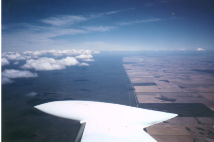
Figure 1: Aerial view of the fence with convective cloud confined to the native vegetation.

soil and vegetation, but still uses a one-source model to estimate the sensible heat flux. Soil evaporation is estimated by a threshold formulation, whereas canopy transpiration is computed as a function of the soil water content. The simulated fluxes of sensible and latent heat from this model, have been found to be in close agreement with observed regional surface heat fluxes (Huang and Lyons, 1995). The application of this model, like other boundary layer models, is dependent on the estimation of a soil moisture profile. A realistic estimate of initial soil moisture is critical, especially for the latent heat flux (Ek and Cuenca, 1994). It has been estimated via a robust water balance technique which provides an estimate of the soil moisture profile directly from long term surface meteorological records (Li and Lyons, 2002).