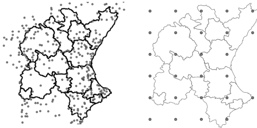
Figure 2. Location of data points (Precipitation variable) for SDSM-INM method (left figure) and data points (Temperature and Precipitation variables) for Analogue-INM method (right figure)

recent historical climate records, or current climate, to obtain future climate series (Mizanur et al. 2007). The anomaly term, which is computed for both temperature and precipitation, and for every CC scenario, constitutes an estimation of the average change of the main climate variables. However, it does not provide any indication of other changes as extreme weather conditions as floods or droughts.