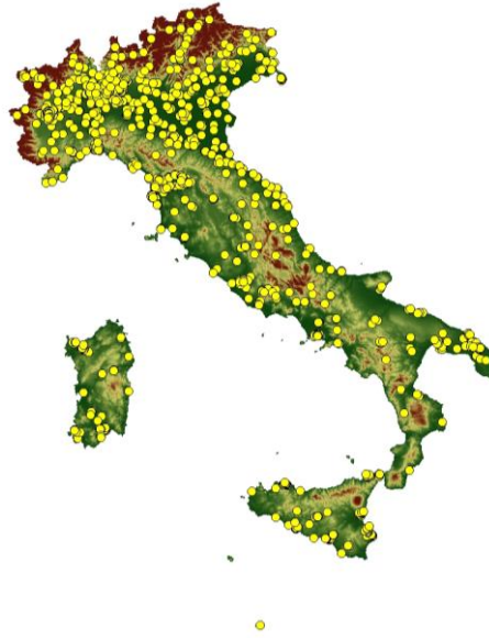
Figure 1. Spatial distribution of the 1081 monitoring stations recorded in ASQUA (yellow points).

The second step pertained to the harmonization and organization of the information in a set of tables linked by relationships and joined through a primary key numerical code called “station_code”.