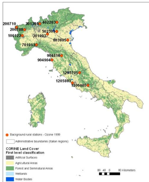
Figure 2. Selection of background rural station that monitored ozone in 1999, overlaid on CORINE land cover. The numerical codes identify each station.

ASQUA database is used for the preliminary analysis on location, distribution and characteristics of monitoring stations. The overlay of several thematic layers in GIS environment gives a valuable contribution to identify the most useful stations according to the investigated pollutant. In this work these layers are: CORINE land cover (2006 updates), Digital Terrain Model derived from SRTM (Shuttle Radar Topography Mission) data with 90 meters spatial resolution, main hydrography, highways and main roads, distribution of urban areas, administrative boundaries. Using ASQUA, the expert user can identify, from the monitoring network, the most suitable stations for the specific analysis to be performed, according to type of pollutant, period of recording, characteristics of the stations and availability of measurements. Figure 2 shows an example of the visualization of selected background rural stations that measured the ozone in the year 1999, overlaid on the CORINE land cover theme with first level of classification.